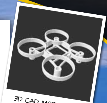
3D CAD MODELLING