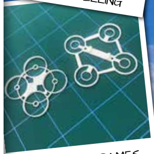
3D PRINTED FRAMES