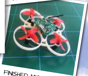
FINISHED MICRO DRONE